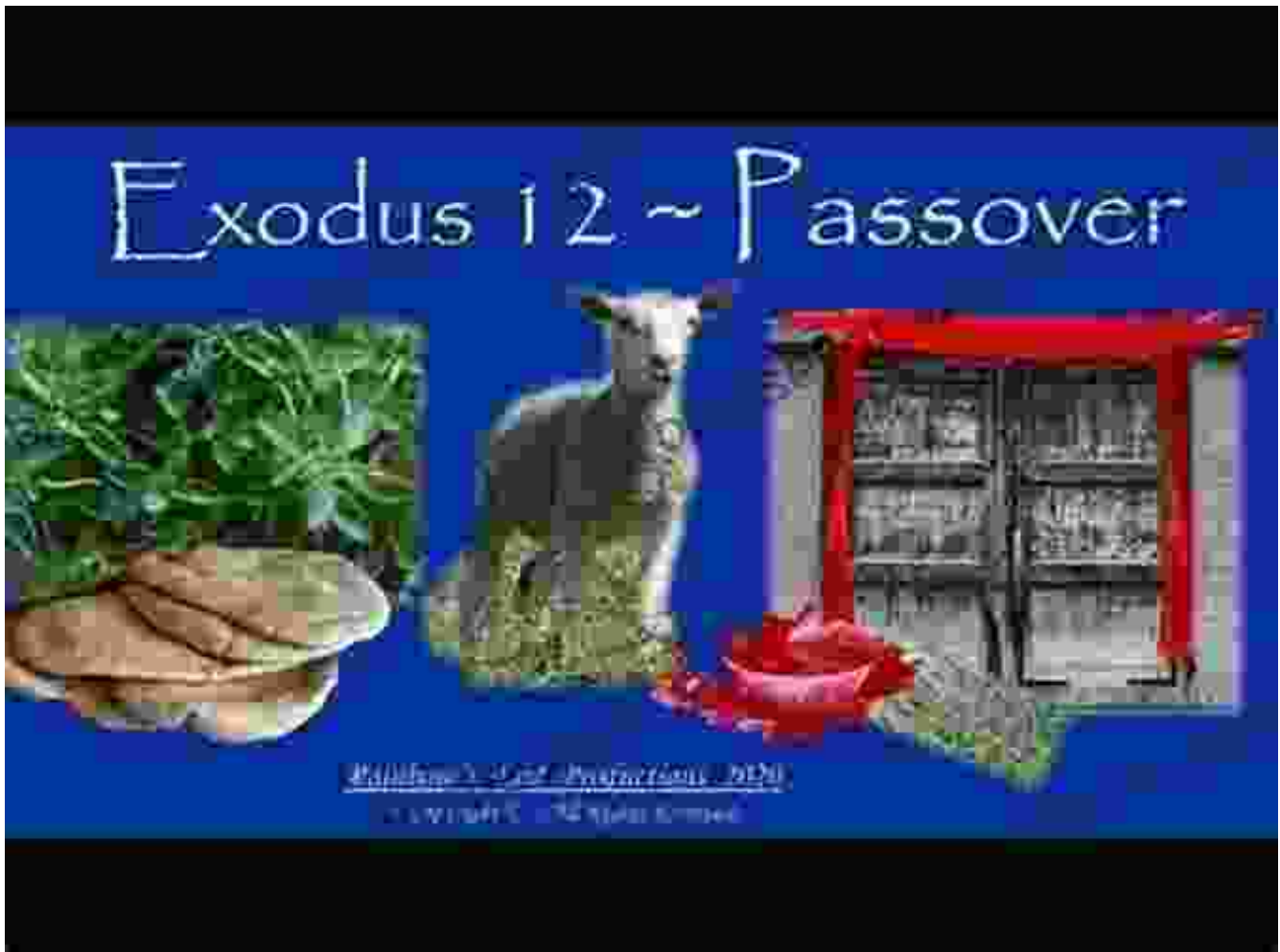
Prophecies Unveiled: Passover's Messianic Significance

Delve into the symbolism of the bitter herbs, a poignant reminder of the Israelites' oppression in Egypt. Discover the significance of the roasted lamb, foreshadowing the sacrifice of Christ on the cross. Rosen's insights will illuminate the rich tapestry of Passover imagery, revealing its profound connection to the Christian faith.