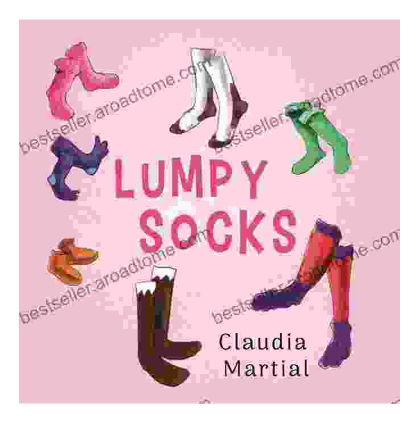
About the Author