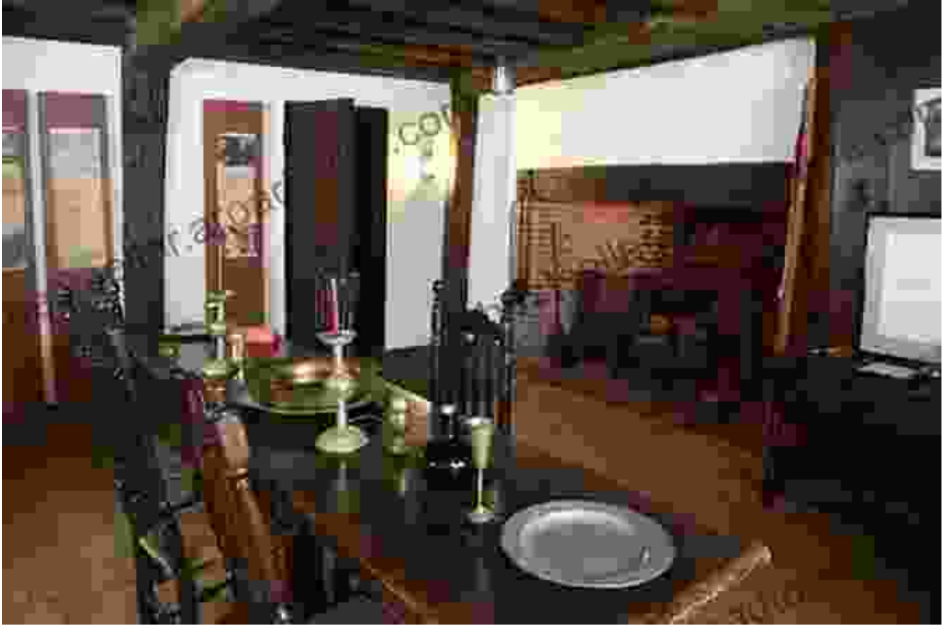
Interior of the Salem Witch House